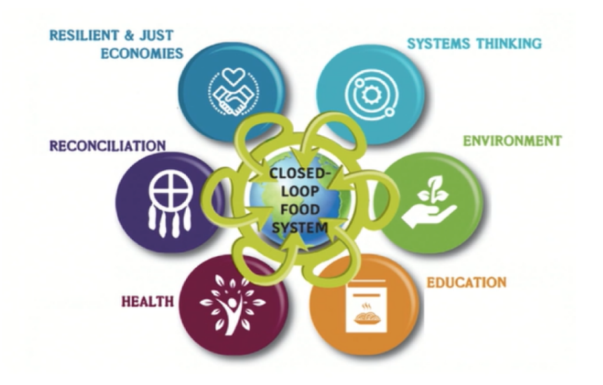
Figure 2. Diagram from Dr. Tammara Soma's Keynote: Presenting a Vision for a Circular Food System in Canada

The closed-loop food system depicted above is grounded in six key areas: